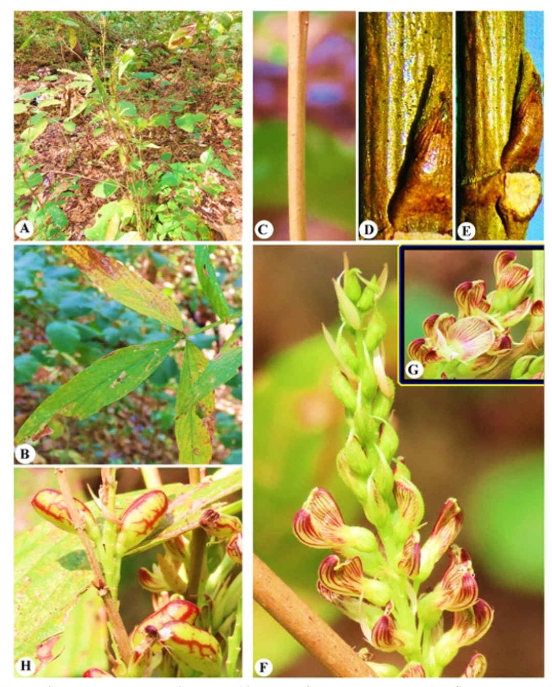
Figure 2: Flemingia praecox var. robusta A. Habitat, B. Leaf, C, D & E. Stem, F & G. Inflorescence, H. Infructescence.

hairy; Calyx 0.8–12 mm long, hairy, gland dotted; campanulate, hairy. Corolla pale yellow with bluish striations; standard 1 \times 1.44 cm long, rounded, apex blunt, glabrous, clawed with 2 auricles; claw 1–1.5 mm long, auricled; auricles 1 mm or less than 1 mm; wing petals 6–6.5 × 1.5–2 mm, oblong, falcate; claw 2-2.2 mm long; black with purple striations; pubescent, keel petals 2-6 mm long; boat shaped, fused at apex at lower side; claw 1.8–2 mm long. Stamens 10, diadelphous (9+1); staminal tube