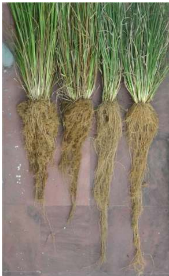
Figure 1. Tufted roots of vetiver showing variation in growth, length and density in different morphotypes of same age.

The vertically growing root system comprises a tuft of primary fibrous roots supported with an array of secondary hairy roots (Figs. 1, 2). Whereas, the Juvenile primary / secondary roots are solid with persistent cortex and little