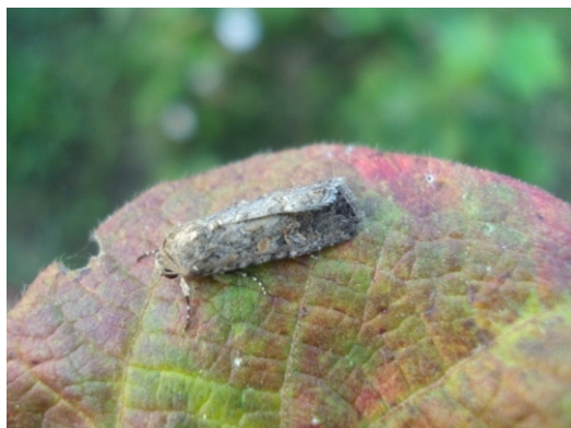
Figure 5: Cutworm, Spodoptera exigua

Spodoptera exigua is native to Southeast Asia and currently found in Africa, Southern Europe, North America, Japan and Australia.