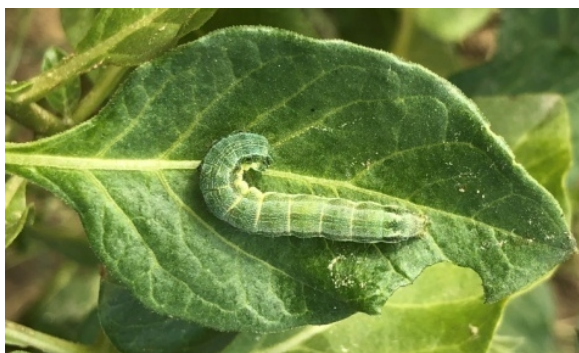
Fig. 18. Helicoverpa armigera

Nature of damage: The larvae feed on tender foliage, flowers and later instars damage the berries. They bore circular holes in berries of Withania somnifera keeping the head portion inside the hole to eat the inner content (Rehaman et al. , 2018).