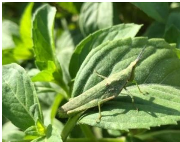
Fig.12. Attractomorpha sp

suckers (propagating materials) from infested planting sites to no infested planting sites. Therefore it is essential and utmost important to use of nematode free planting material would check the spread of pathogen.