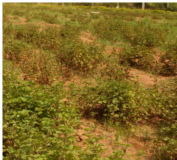
Figure 16. Root-knot nematode infested field of patchouli