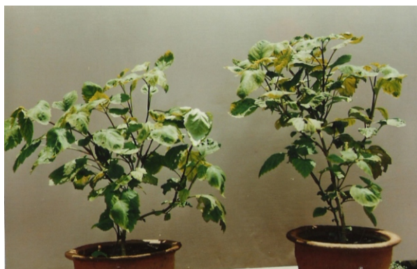
Fig. 14. Alternaria Blight of Pogostemon cablin

which feeds on the leaves of patchouli and showing nibbling symptoms (Triveni, 2017). Adult weevils, Blosyrus sp., and M. viridanus feeds on the leaf margin of patchouli (Triveni, 2017). Sanjta and Chauhan (2018) recorded infestation of five species of thrips, viz. Bathrips melanicornis , Thrips carthami , Anaphothrips sudanensis , Aeolothrips sp. and Haplothrips sp. on patchouli.