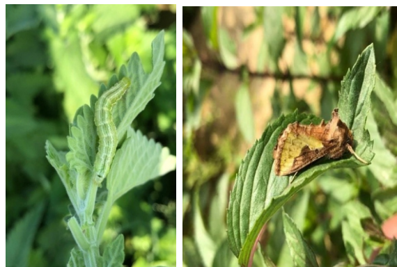
Figure 2: Soybean semilooper, Thysanoplusia orichalcea