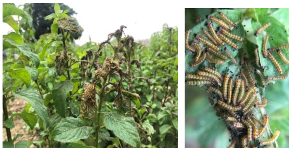
Figure1: Spilosoma obliqua

yellowish green eggs in clusters on the underside of leaves. The incubation period is 5-13 days. The larvae complete development in 4-8 weeks through 6-7 instars. The early three instars feed gregariously and later instars feed solitarily. The larvae are yellowish orange and covered with hairs (Fig.1). The full grown larvae spin a loose silken cocoon in which it pupates in plant debris or in the soil. The pupal duration of is 10–15 days. The adult moth longevity is 5-7 days. The total life cycle is completed in 6-12 weeks. The Bihar hairy caterpillar passes through three to four generations in a year.