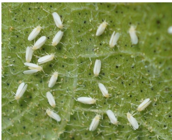
Figure 7. Cotton whitefly, Bemisia tabaci

devastating pest of different crops throughout the tropical and subtropical regions of the world (Oliveira et al. 2001).