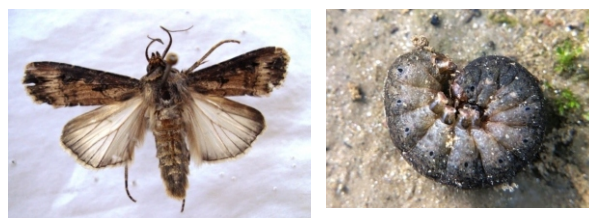
Figure 4: Black cutworm, Agrotis ipsilon

Identification and Biology : The moth is stout and has wavy lines and spots on brownish forewings whereas; hindwings of adults are off-white with dark veins (Fig.4). The larva is dark brown in colour (50 mm long) with a distinct yellow dot on each segment down the centre of back. The female lays about 300 eggs in groups of 30 on the under surface of leaves or moist soil. The egg, larval and pupal periods are respectively 2-13, 10-30 and 10-30 days. Larva moults six times to become pupa. The total life cycle lasts from 30 to 68 depending on weather conditions. The pest completes four