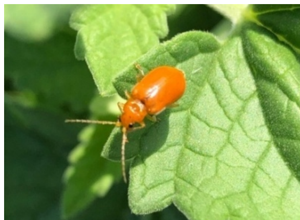
Figure 8: Red Pumpkin Beetle, Aulacophora foveicollis