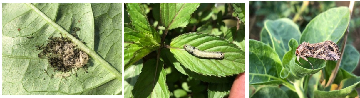
Figure 3: Spodoptera litura

leaves singly. Incubation duration ranges between 3 to 4 days. The caterpillar passes through 6 larval instars and larval period ranges between 16-23 days. The full grown larva pupates in loose silken cocoon on the lower side of leaves. The pupal period varies from 6 to 9 days. Life cycle is completed in 30-35 days.