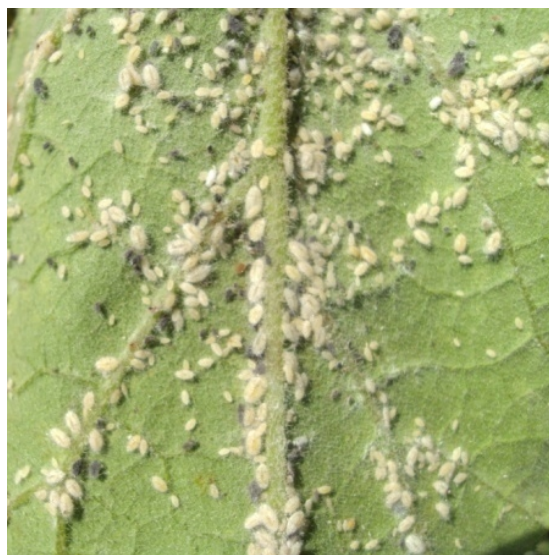
Figure 20. Eggplant mealybug, Coccidohystrix insolitus mealybugs.

Nature of Damage: Nymphs and adults of mealybugs suck sap from the under surface of leaves and tender shoots (Fig.20). The attack results in yellowing and sometimes dying of plants. A heavy black sooty mould may develop on the honeydew like droplets secreted by