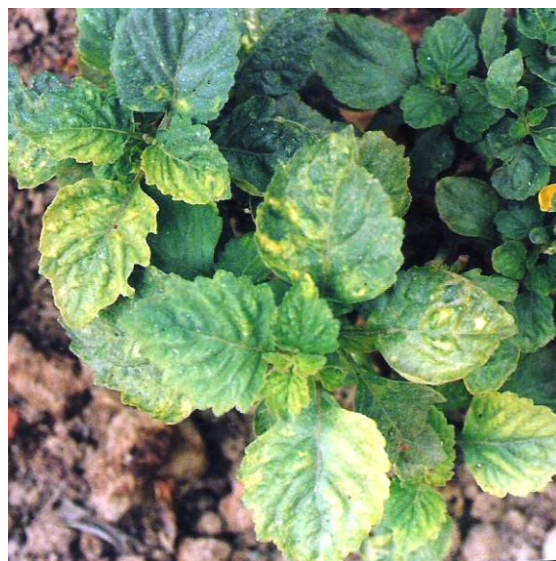
Figure 15. Yellow mosaic symptoms on Pogostemon

Certain strains of Trichoderma hamatum and T. pseudokoingii are reported to be adapted to excess soil moisture, whereas T. viride and T. polysporum are restricted to low temperature conditions. T. harzianum is most commonly distributed in warm climate region, whereas T. hamatum T. koningii are reported to be distributed under diverse environmental conditions. Species of Trichoderma have been shown to be effective against wide range of plant pathogens, such as Botrytis sp., Fusarium sp., R. solani , Sclerotium rolfsii , etc. Various mechanism of parasitism by Trichoderma sp. on different plant pathogenic fungi are reported to be varied such as inhibition by contact action, parasitism, hyphal interaction, coiling, penetration and lysis of hyphal cell, antibiosis and production of toxic metabolites etc. (Hriday, 1991). Hartman and Fletcher (1991) reported Trichoderma harzianum to be