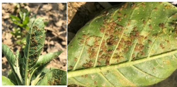
Figure 22. Myzus persicae

Nature of Damage; Nymphs and adults of aphids feed on the young foliage of W. somnifera and stems during December to March in North Indian conditions (Kumar et al. 2009). They suck the cell sap from tender shoots which often results in drying out shoots, causing wilts and distortion. Aphids produce honeydew which falls onto foliage and which leads to black sooty mould fungi development. The development of sooty mould reduces the photosynthetic ability of the plants. M. persicae is most important aphid virus vector. More than 100 plant viruses have been reported to be transmitted by M. persicae .