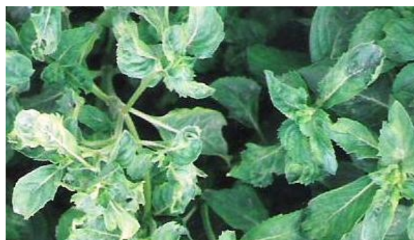
Figure 11: Mosaic on leaves of M. gracilis

A mosaic disease of M. arvensis was suspected to be caused by virus, was reported as early as in 1965 in India, but the causal virus could not be characterized (Nene et. al 1965). The genus