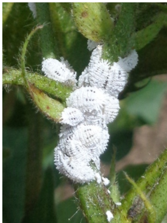
Figure 19. Solenopsis mealybug, Phenacoccus solenopsis

Identification and Biology: The mealybug is cottony in appearance, small, oval, soft-bodied covered with white mealy wax (Fig.19). Adult females are wingless, 2.5-4.0 mm long with 9 segmented antennae and long flagellate dorsal setae. Short filaments around the body and dark stripes on the dorsal side are present. The anal filaments are about one fourth the length of the body. Females produce egg mass in an ovisac. Males have one pair of wings, long antennae and absence of mouth parts with white wax filaments projecting posteriorly (Kedar et al. , 2013). The developmental period of first,