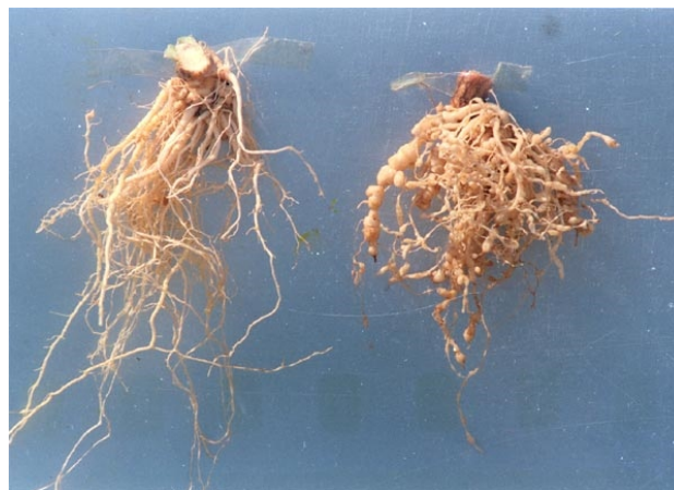
Figure 24. Healthy & root-knot infested plant and roots of Egyptian henbane ( H. muticus )