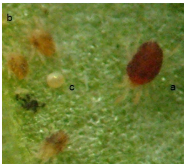
Figure 21. Tetranychus urticae a) adult; b) nymphs; c) egg

the season. It is generally found on the under surface of the leaves but, in heavy infestations, it may be found all over the leaf surface. Nymph and adult mites punctures the leaf tissue and oozing plant sap is sucked. The removal of plant sap with chlorophyll and other plants pigments results in the characteristic blotching of leaves. The affected leaves become mottled. Mite infested plants can be diagnosed from distance by characteristic mottling symptoms produced on the upper surface of the leaves. Under severe infestation, the mites move to the tip of the leaves or top of the plant and congregate using strands of silk to form a ball like mass, which will be blown by winds to new leaves or plants, in a process known as “ballooning”.