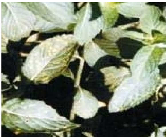
Figure 10. Rust of Mentha arvensis caused by Puccinia menthae

(Shukla et al. 1999). The young shoots infected by rust fungi are usually twisted and most of the times broken off at the infection site (Fig. 10).