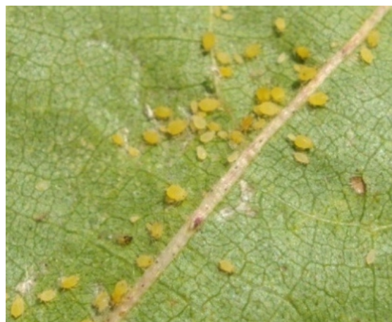
Figure 13. Aphis gossypii

Patchouli is an important aromatic plant, belonging to family Lamiaceae is the major source of commercial patchouli oil. In the perfumery industries still there is no synthetic chemical which could replace the patchouli oil. It is native of the Phillipines and cultivated mainly in Malaysia, Jawa, Brazil, West Indies, Singapore, Indonesia, China and India. It is a perennial aromatic herb that yields fragrant leaves containing very sweet smelling oil, attains a height of about 1m – 1.2 meter. The chemical components of patchouli oil are b-patchoulene, a-guaiene, caryophyllene, a-patchoulene, seychellene, a-bulnesene, norpatchoulene, patchouli alcohol and pogostol. It is propagated by stem cuttings. The commercial oil of patchouli is obtained by steam distillation of the shade dried herbage. The oil of patchouli has a strong fixative property, which helps to prevent the rapid evaporation of perfume and thereby promotes tenacity. The oil is generally blended with other essential oils. It is used in a wide range of toilet soaps, scents, body lotions, etc. At very low concentration, the oil is extensively used to add