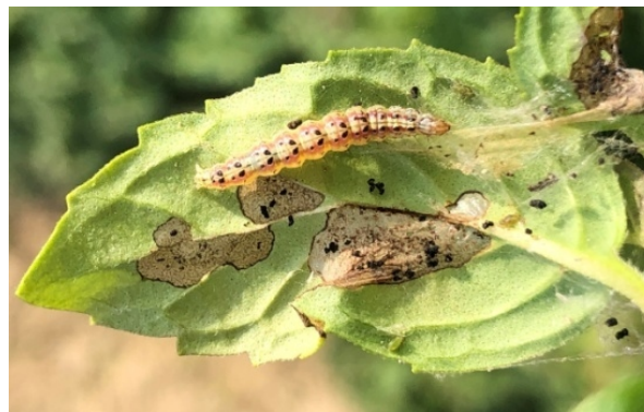
Figure 6. Syngamia abruptalis

It occurs in the tropics of the Old World from Africa to Australia.