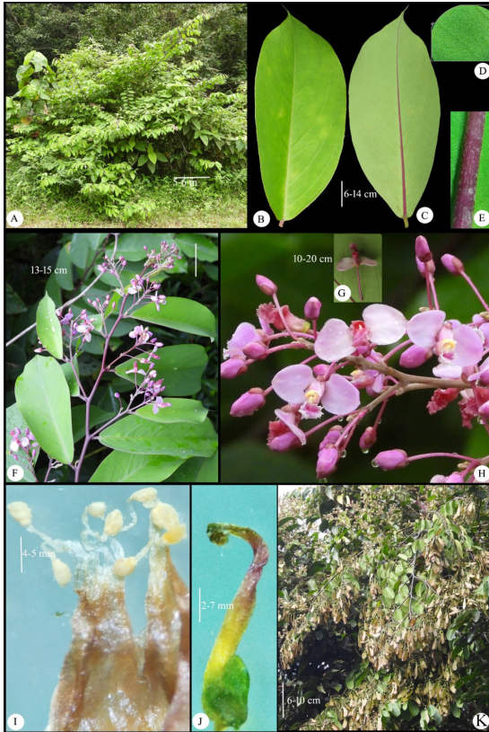
Fig. 2: Securidaca inappendiculata Hassk., A – Habitat; B, C, D, & E – Leaf both sides and closeup of leaf lower surface and stem portion; F – Flowering twig; G & H – Inflorescence and flower closeup; I – Anthers; J – Ovary; K – Fruiting twig.