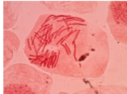
Figure 1: Lilium cultivar Tresor Mitotic metaphase showing 2n=4x=48

subterminal position. Chromosome pair VII had centromere at terminal end with length 14 \mu\text{m} . Chromosome pairs VIII, IX, X, XI, XII showed absolute length 13.75, 13, 13, 12.5, 11.25 \mu\text{m} respectively having subterminal centromeric position. Out of all pairs, 2 pairs had terminal region of centromere while only one pair showed submedian location on chromosome and pair IV, V, VI, VIII, IX, X, XI and XII found to be subterminal in position. Arm ratio ( r ) varied from 1.76 to 8.71. Similarly, centromeric index ( i ) showed lowest range 10.29 and highest 36.17. The relative chromosome length (RCL%) varied from 47.87 to 100. The TCL was recorded 183.5 \mu\text{m} (Table 1). The total form percent (TF%) was found to be 18.25 and karyotype asymmetry index (As K%) was 81.74. The centromeric gradient (CG) was 17.24, coefficient of variation (CV) was 21.90 and dispersion index (DI) was 3.77 noted. The karyotype formula suggested for Lilium cv. Tresor was 4\text{sm}+36\text{st}+8\text{t} . The karyotype was asymmetric and 3A type (Table 2).