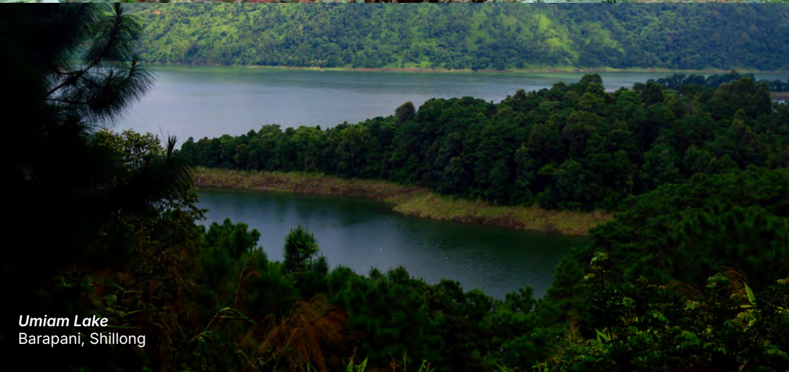
Umiam Lake Barapani, Shillong