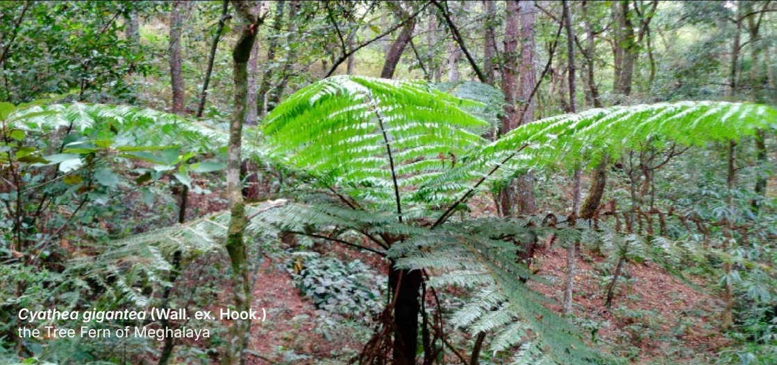
Cyathea gigantea (Wall. ex. Hook.) the Tree Fern of Meghalaya