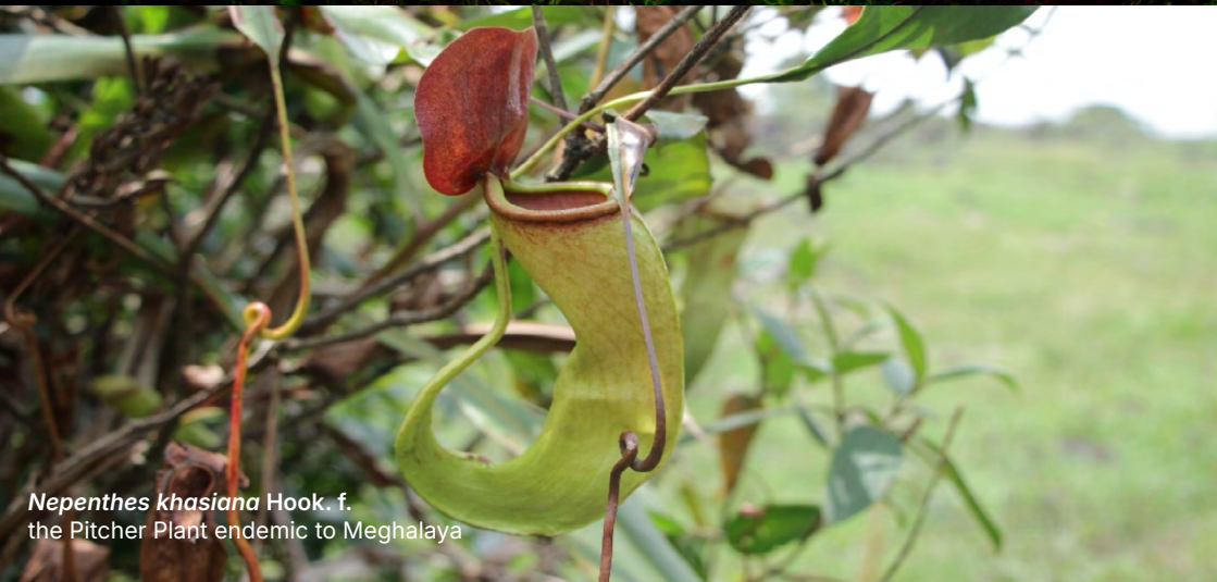
Nepenthes khasiana Hook. f. the Pitcher Plant endemic to Meghalaya