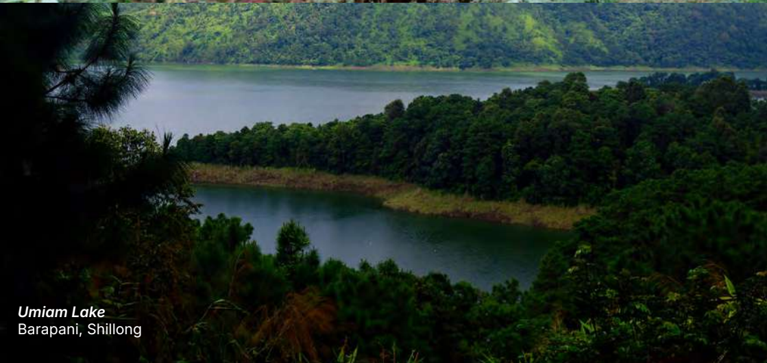
Umiam Lake Barapani, Shillong