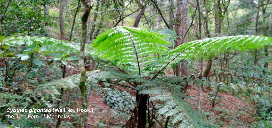
Cyathea gigantea (Wall. ex. Hook.) the Tree Fern of Meghalaya