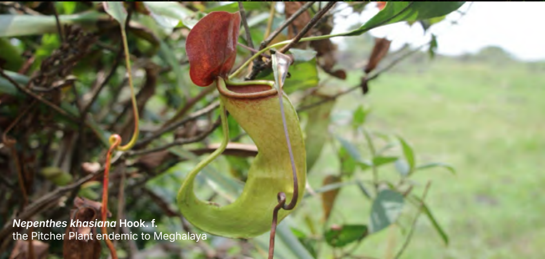
Nepenthes khasiana Hook. f. the Pitcher Plant endemic to Meghalaya