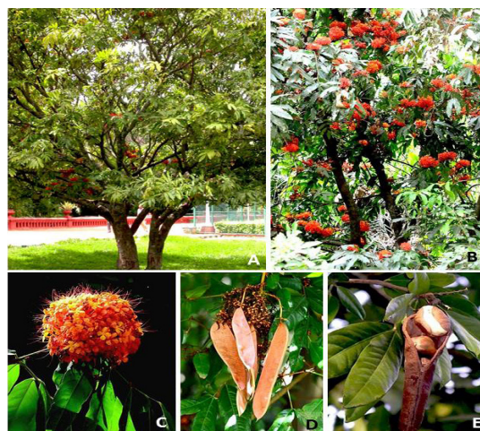
Figure 1: Saraca asoca . A. Tree in flowering stage. B. A close view of the twig. C. An enlarge view of inflorescence. D. Pods. E. Pod with seeds.

Saraca asoca is a small to medium-size evergreen tree with a dense and spreading crown (Figure 1). The tree can grow up to 7 - 10 m in height. The bark is grey or dark brown covered with a warty surface. It is uneven and rough to touch, due to the presence of projecting lenticels and circular lenticels and is channelled or sometimes cracked (Boroker & Pansare 2017). The leaves are alternate, paripinnate, 15-20 cm long, copper red when young and green on maturity. The leaves have 4 - 6 pair of leaflets which are oblong-lanceolate, obtuse or acute, glabrous with rounded base; petioles are short (Boroker & Pansare 2017). Flowers are fragrant, and borne in dense axillary corymbs. They are bisexual, aromatic, staminate and astringent in taste. Young flowers are yellow which gradually turn to orange and scarlet red on maturity (Mishra & Vijaykumar 2015). Pods are linear, oblong, compressed, dehiscent, tapering to both ends and are green and leathery which turns to brownish purple or black on maturity. Each pod contains 4 - 8 seeds which are ellipsoid, oblong, compacted and covered with a seed-coat. The seeds turn black on maturity and are recalcitrant type (Chauhan 2019).