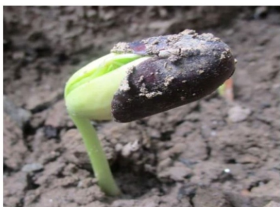
(d) Penetrance of radical in soil.