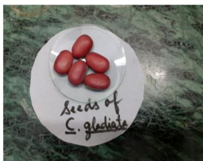
(a) Fresh dry seed.