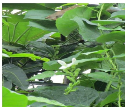
(g) Plant showing inflorescence and flower.