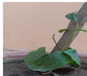
(f) Establishment of plant showing trifoliate leaf