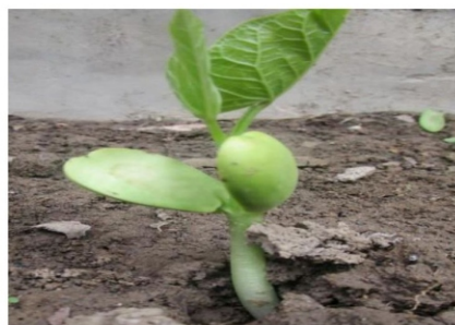
(e) Emergence of leaves