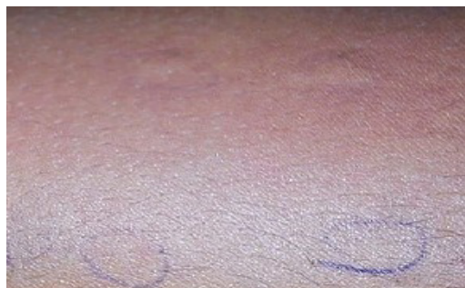
Figure 5: A patient suffering from Allergy and having SPT

Parthenium dermatitis poses a significant challenge in both urban and rural India. Patients with severe allergic rhinitis, exposed to parthenium pollens, reportedly exhibit parthenium-specific IgE and IgG antibodies (Sriramarao