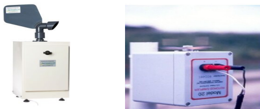
Figure 3: Rotorod sampling device

Among the various plant species, P. hysterophorus pollens were found to be present in higher concentrations. Temperature measurements, ranging from minimum to maximum, were recorded using a thermometer. The data were then analyzed and processed using Microsoft Excel 2007 to display the spatial and temporal relationship between P. hysterophorus pollen, temperature, and their effects on human health.