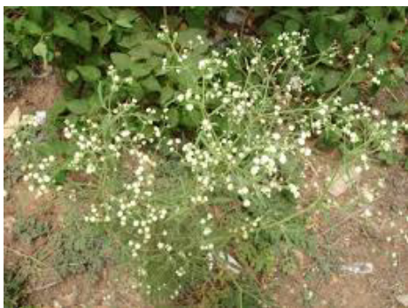
Figure 1: Parthenium hysterophorus plant Species

allergy among individuals with existing allergies residing in Chapra town, Bihar, India, with the intention of gaining a thorough comprehension of this matter. Furthermore, the research seeks to identify the specific substances that trigger allergic responses. The study provided valuable insights into the prevalence and patterns of parthenium allergy in the region and helped in developing effective prevention and management strategies for the condition.