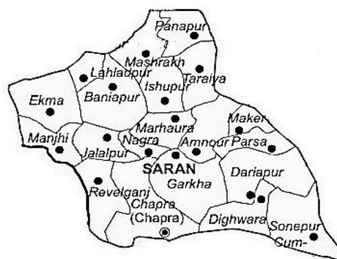
Figure 2: Geographical map of the study area

The IMD provided daily environmental parameter data from 2018 to 2020, while data on pollen allergy patients were